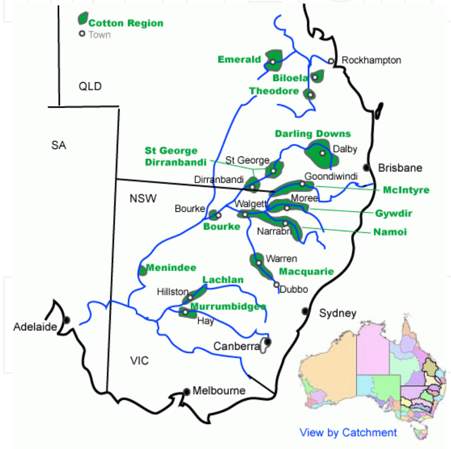
Figure 1. Australian cotton production regions

2% of pima cotton ( Gossypium barbadense ). Since 2010, as a result of a long drought and eventually loss of infrastructure to support its processing, there has been no Pima cotton grown in this country. The Commonwealth Scientific and Industrial Research Organisation (CSIRO) cotton breeding program has developed and released over 100 very successful cultivars adapted to local conditions with a high yield and quality. By 2000, these had displaced all imported cultivars and any other local competition and currently all cotton grown commercially in Australia stems from that program. Between 1995 and 2009, yield progress from the CSIRO program was an impressive 18.3 \text{ kg ha}^{-1} \text{ year}^{-1} , with 48% of that yield improvement directly attributed to cultivar, 28% to improved management and 24% to the interaction between cultivar and management [2], making Australia one of the highest yielding cotton producers per hectare globally.